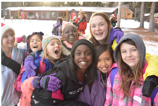
Above: Kampers snowshoeing.