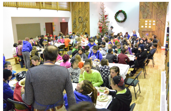
Right: Kampers enjoying turkey dinner.